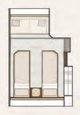
Mid cabin sliding beds (cost option)