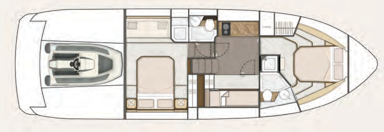
3 Cabin (cost option)