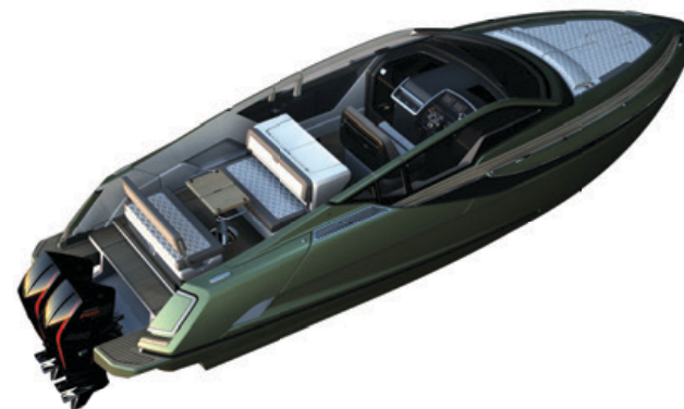
MATTE PINE GREEN METALLIC