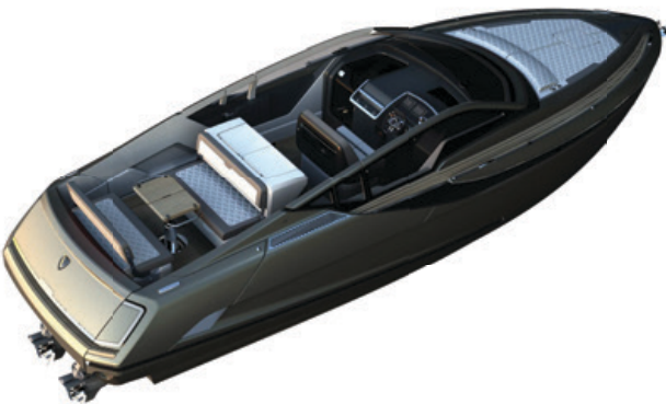
SATIN DARK GREY