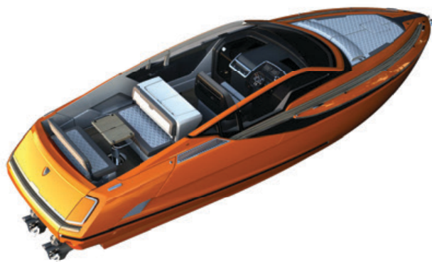
SUN BURNT ORANGE

Choose the colour you desire, whether it's one shown here or your own choice, and your F//LINE 33 will become wholly yours.