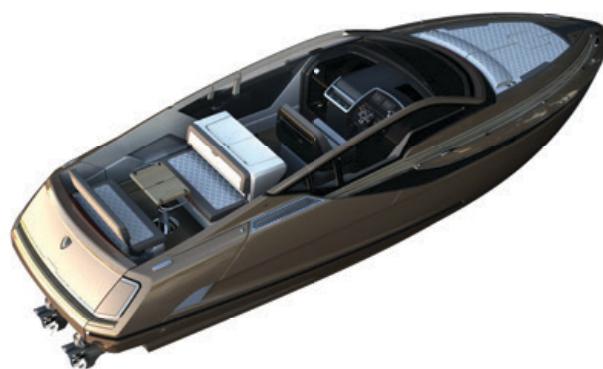
ASHEN METALLIC GLOSS