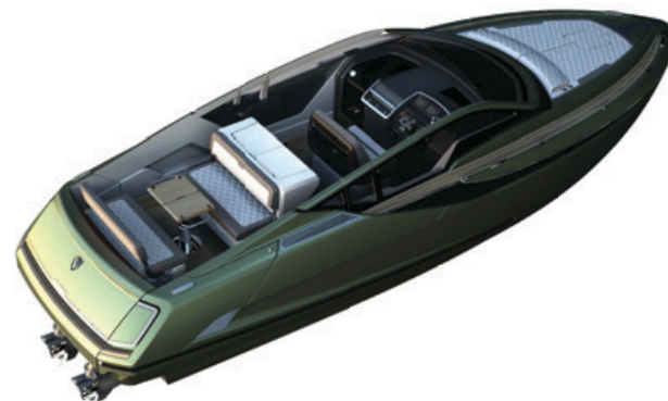
MATTE PINE GREEN METALLIC