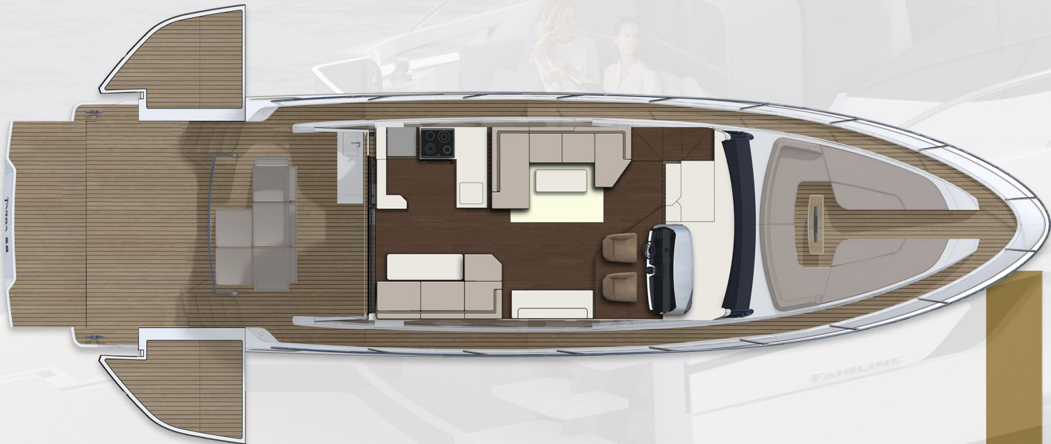
Main Deck - Beach Club