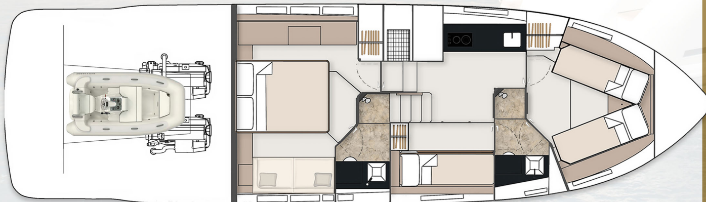
3 Cabin (cost option)